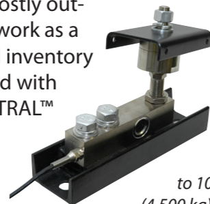
Load Cells handle up to 10,000 pounds (4,500 kg) per feed bin leg.

Our CHORE-TRONICS® Feed Inventory System provides an economical means for managing and monitoring feed stored in feed bins on the farm. Producers easily check feed bin weights by using a read-out screen. Getting precise weights aids in better managing feed inventories and helps to prevent costly out-of-feed events. Designed to work as a stand-alone system, the feed inventory system also can be connected with Chore-Time's popular C-CENTRAL™ Software to provide remote location and multiple house monitoring.