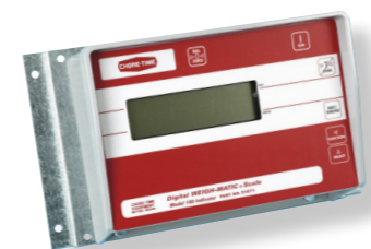
Model 100 Indicator

Find your authorized independent distributor at choretime.com/distributor