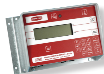
Model 200 Indicator

Chore-Time's Digital WEIGH-MATIC® System keeps an inventory of the amount of feed in storage at all times without the use of a secondary weigh bin. The system includes temperature-compensated load cells and has two Digital Scale Indicator options.