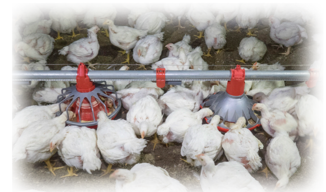
39 Days Old