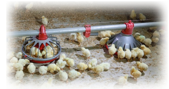
Three Days Old