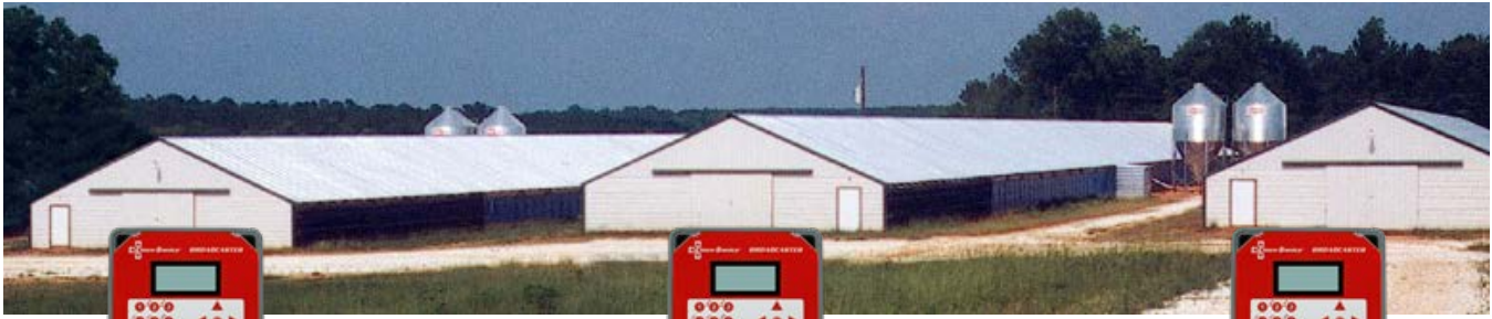
BROADCASTER™ Main Box