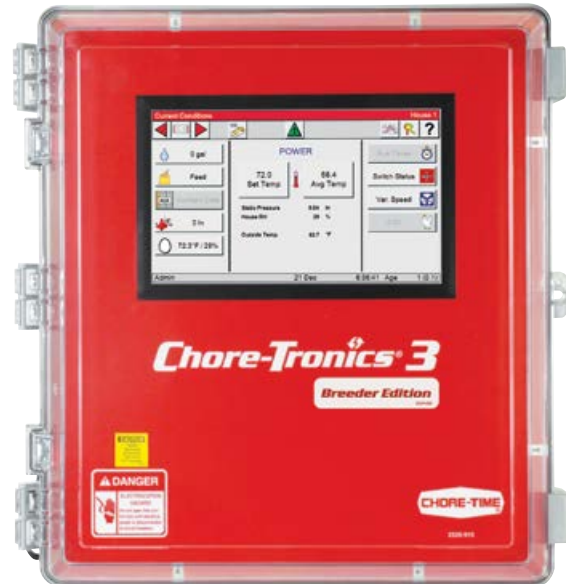
CHORE-TRONICS® 3 Breeder Control includes extra capabilities especially for breeder production.