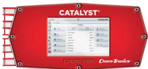
Use with CATALYST® Control for a complete package.

Count on Chore-Time for experience, reliability, performance and confidence.