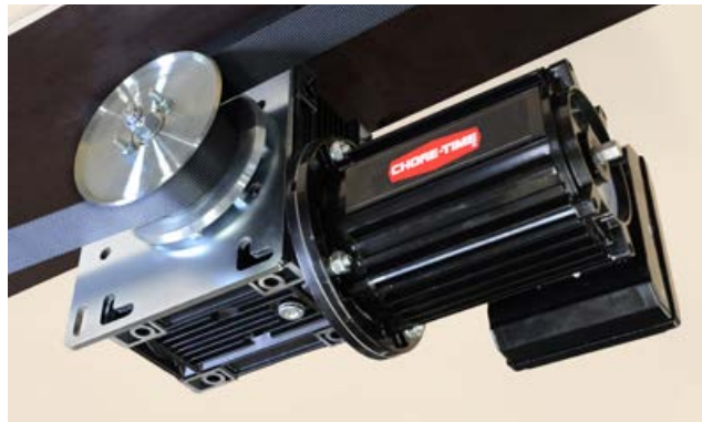
56929 Product may differ slightly from image shown.