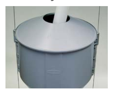
Built-in tube support holds drop tube in position and permits easy drop tube removal for house clean out.

Optional molded plastic cover helps keep birds out of hopper and includes a drop tube opening.