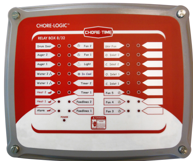
CHORE-LOGIC™ Relay Box 8/32