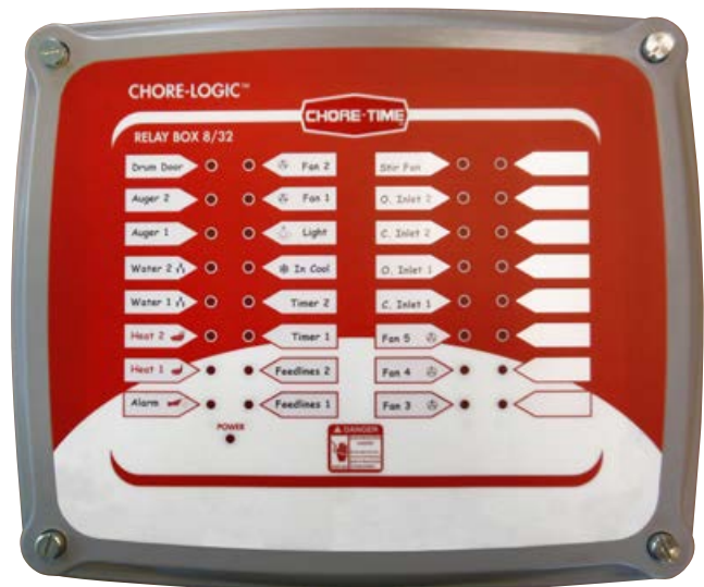
CHORE-LOGIC™ Relay Box 8/32