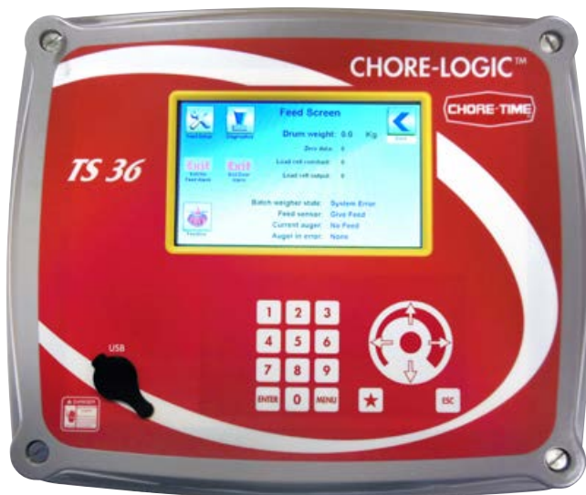
CHORE-LOGIC™ TS36 Control